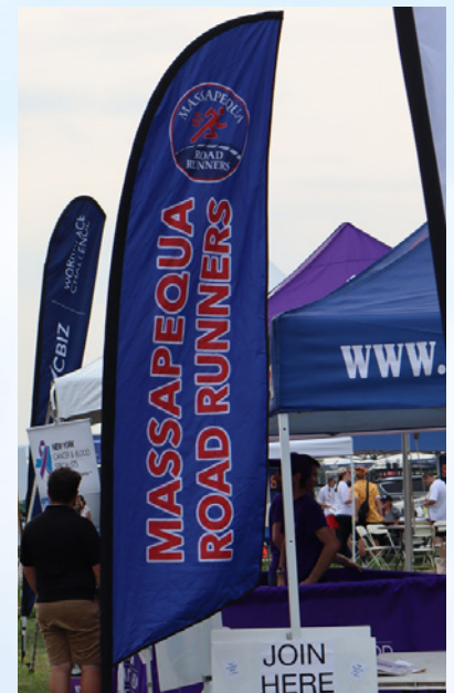
Thanks Massapequa Road Runners!