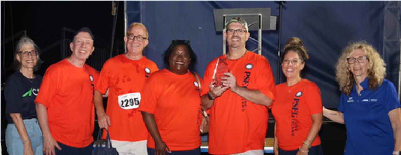
PSEG Long Island–Beneficiary Fund Challenge Team Award