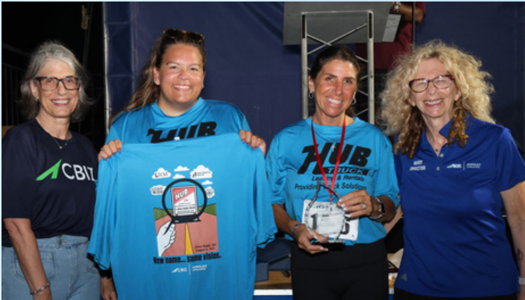
Hub Truck Rental- Most Colorful T-Shirt Award