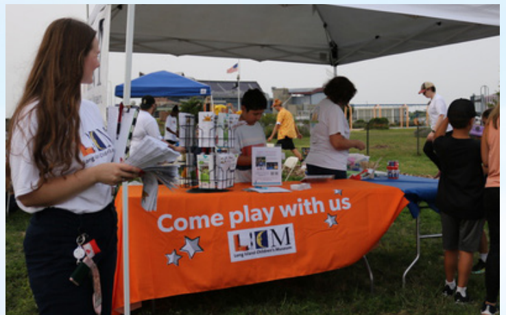
Long Island Children's Museum

Find event results/awards at: cbizworkplacechallenge.com/results/2025 Find event photos at: cbizworkplacechallenge.com/about/media/photos