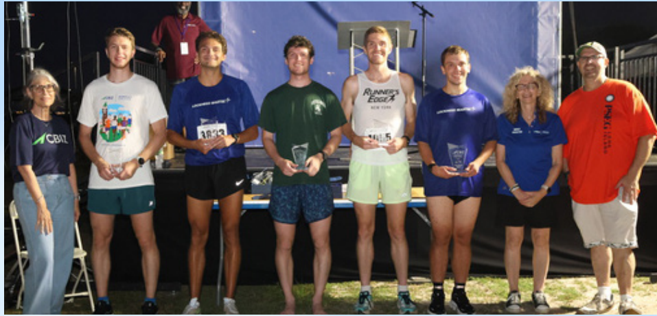
Top 5 Men