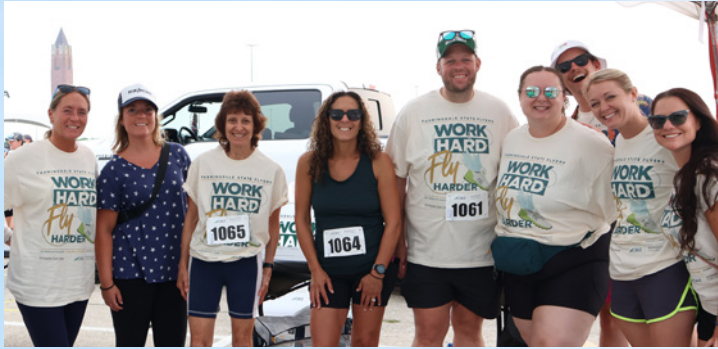
Farmingdale State College

GE Aerospace GFT Gramercy Risk Management Grant Thornton