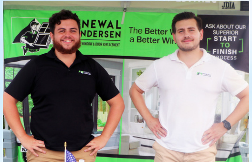
Renewal by Andersen