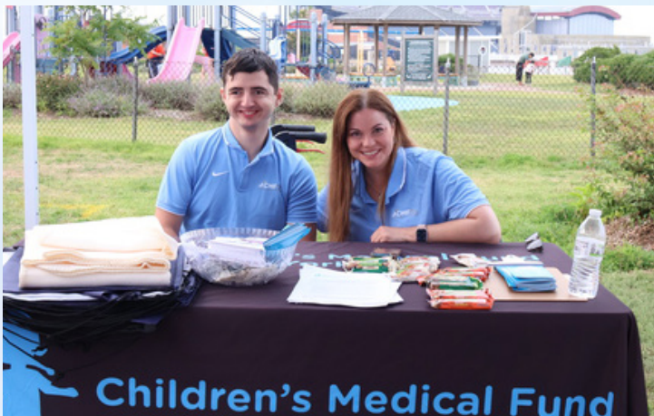
Children's Medical Fund of NY