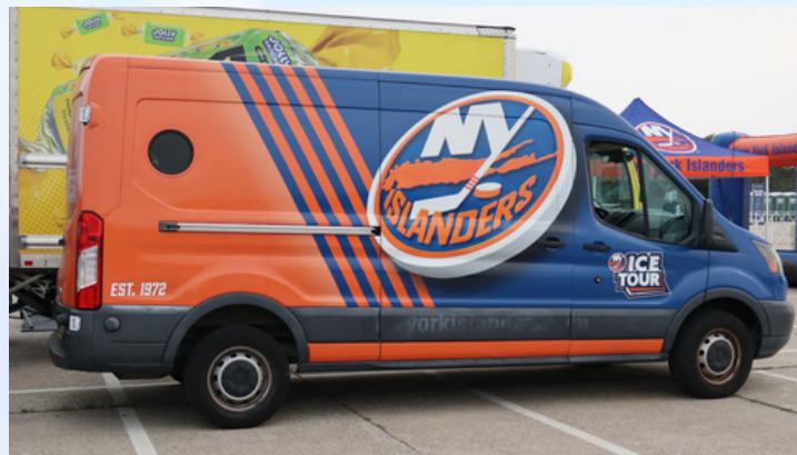
New York Islanders

Find event results/awards at: cbizworkplacechallenge.com/results/2025 Find event photos at: cbizworkplacechallenge.com/about/media/photos