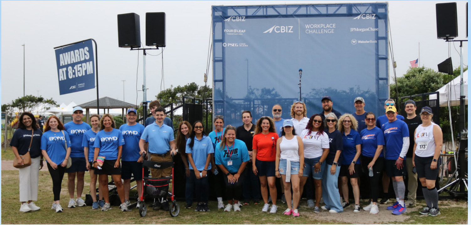
Sponsors and Beneficiaries

PSEG Long Island is proud to support CBIZ Workplace Challenge