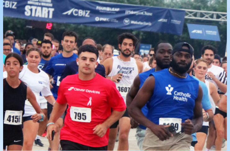
Group of runners at start of the race