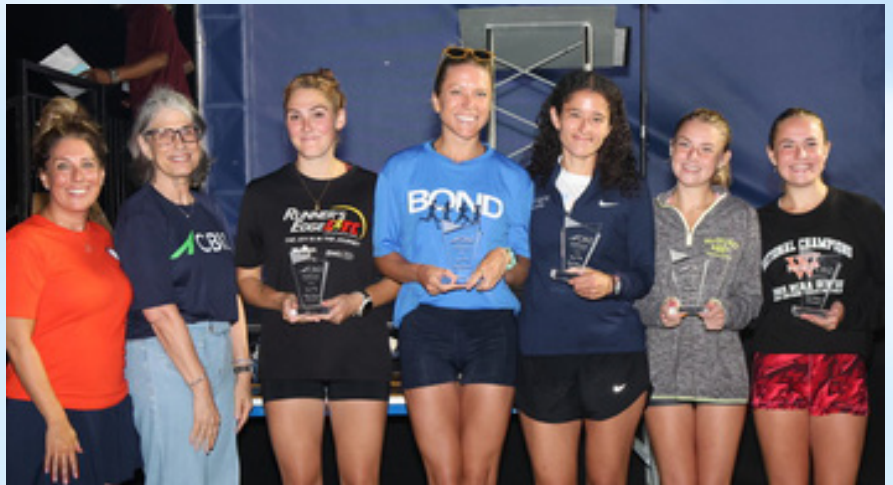
Top 5 Women