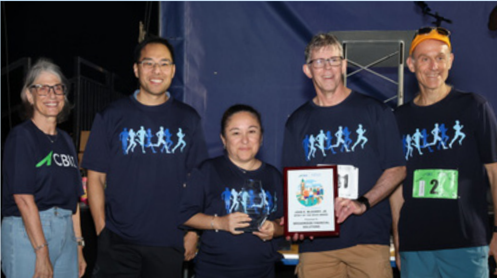
Broadridge Financial Solutions–Greatest Participation Award and Spirit of the Race Award