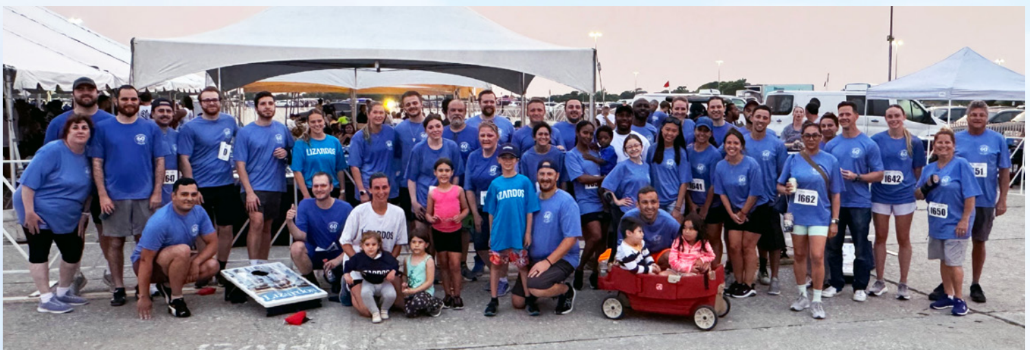
Lizardos Engineering Associates D.P.C.

H2M architects + engineers Hayduk Engineering, LLC HUB International HUB International (F&F) HUB Truck Rental