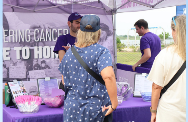
New York Cancer & Blood Specialists