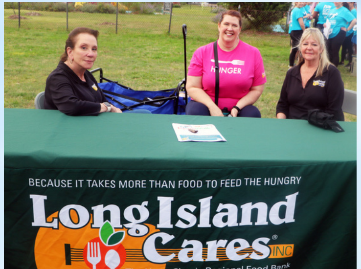
Long Island Cares-The Harry Chapin Food Bank