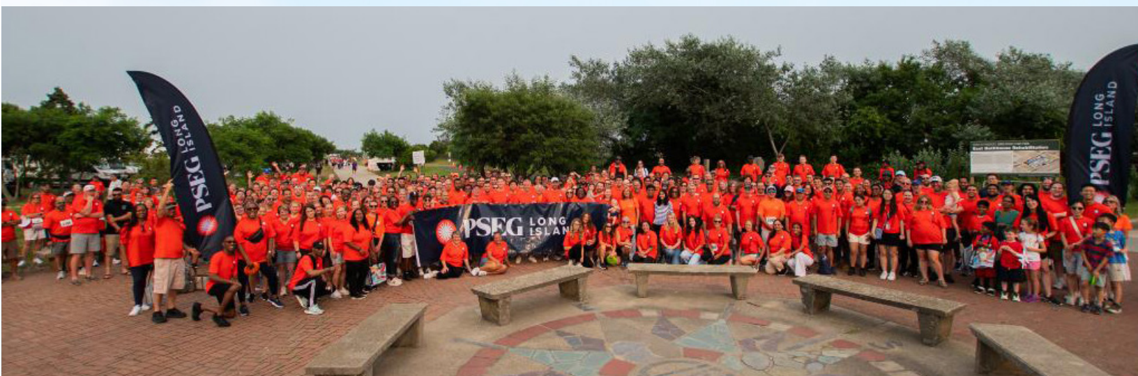
PSEG Long Island

Team CBIZ Team Forward-IPS Team Parks Total Dealer Solutions Webster Bank XC Divas Zebra Technologies Zuma Payroll Stride Squad