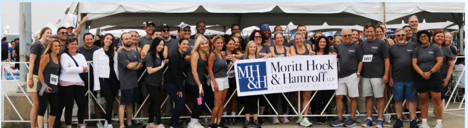
Moritt Hock & Hamroff

Micross Mini-Circuits Moritt Hock & Hamroff ,LLP Nassau BOCES