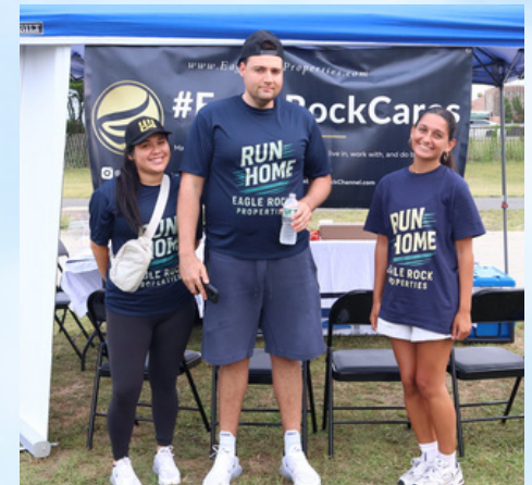
Eagle Rock Properties

Catholic Health - Good Samaritan University Hospital Catholic Health Home Care & Good Shepherd Hospice St. Catherine of Siena Hospital Catholic Health - St. Charles Hospital