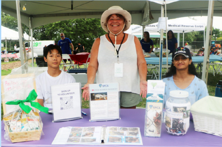
Nassau County SPCA